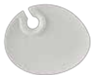
Wine and Appetizer Plate GZP-650 | 10" x 8 \frac{1}{8} " x \frac{3}{4} " | 1 doz