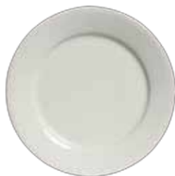
Round Plate BPA-160 | 16" | 4 pcs