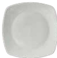
Square Plate BPH-126C | 12 \frac{3}{4} " | 6 pcs