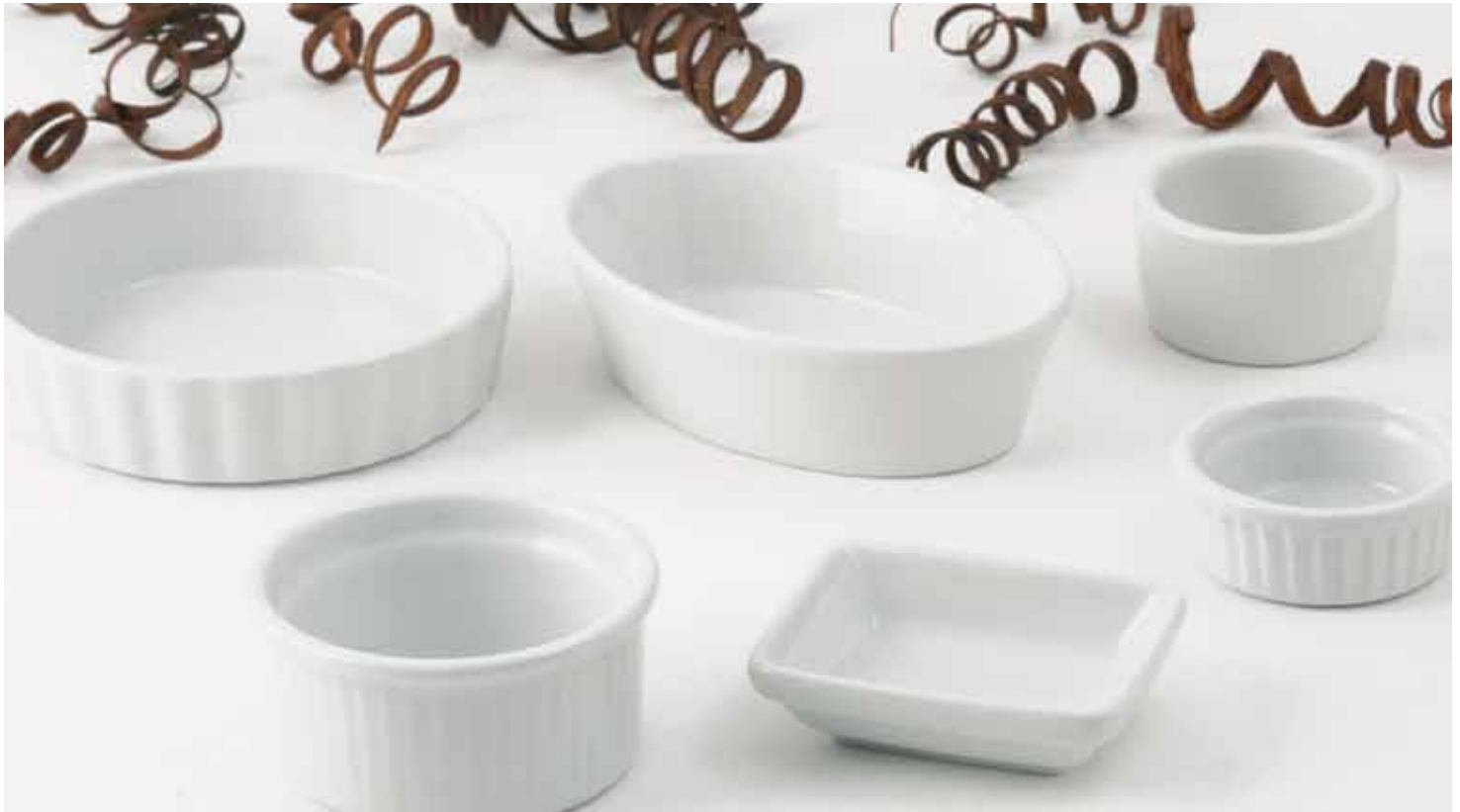
Pictured Items: BPK-0805, BPX-0502, BPK-060, BPZ-033B, BPX-0203, BPX-0162