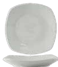
Square Pasta Plate Coupe [26oz] BPH-105J | 10 \frac{1}{2} "W x 1 \frac{3}{4} "H | 1 doz