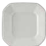
Octagon Plate BPH-070E | 7" | 1 doz