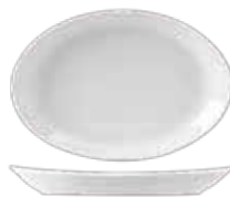
Wing Platter ALH-111W | 11 \frac{1}{8} " x 7 \frac{1}{2} " | 1 doz ALH-136W | 13 \frac{3}{4} " x 9 \frac{1}{4} " | 1 doz