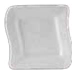
Wave Plate BPZ-063C | 6 \frac{3}{8} " | 1 doz